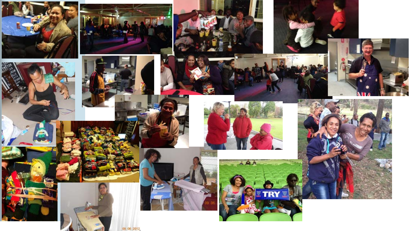
Fundraiser event for the Kids with Aids