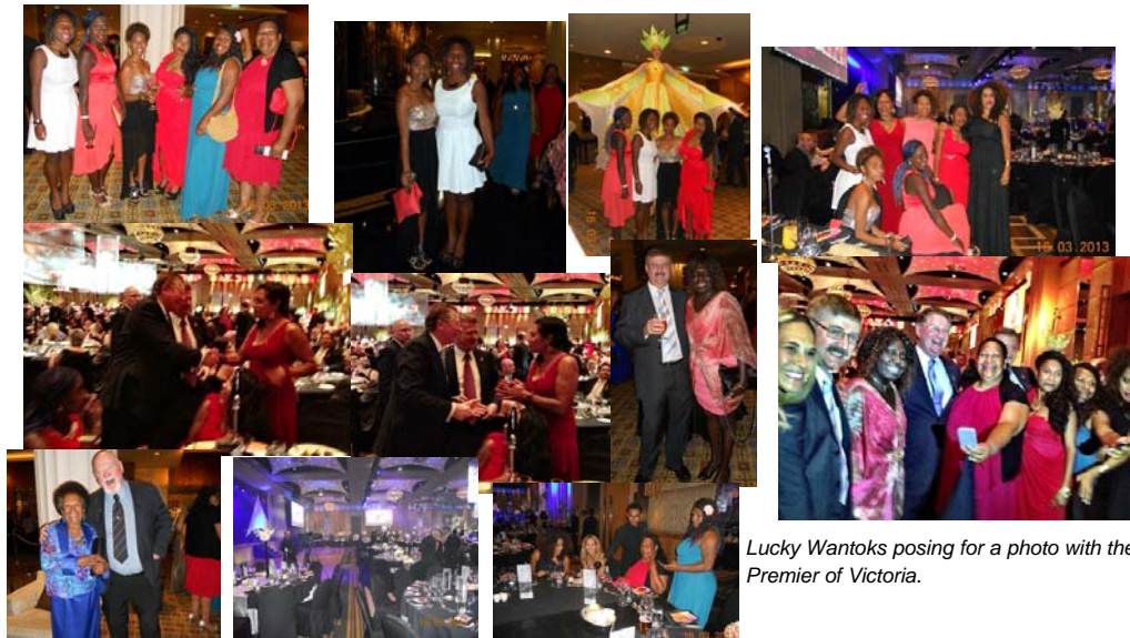
Lucky Wantoks posing for a photo with the Premier of Victoria.

Look out for next year's event, if you want to come along because we will widely advertise to our members.