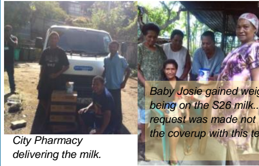
City Pharmacy delivering the milk.