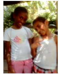
Happy girls posing after receiving clothes donated by Friends of Adelaide, SA.