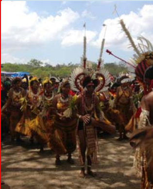
Independence Celebrations in PNG