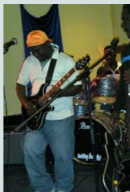
Niigana—take it away!