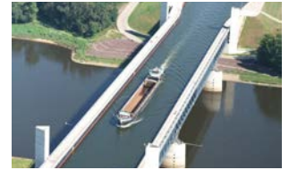
Seen anything like it? A river on a river. Amazing! The Incredible Magdeburg Water Bridge in Germany